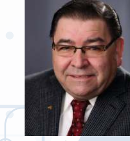
Butte • District 3