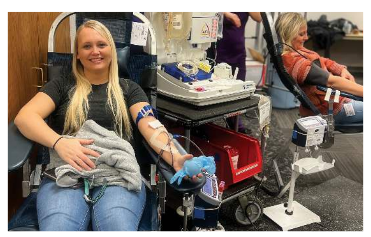
BLOOD DRIVE – Employees volunteered to give blood at SRT's biannual blood drive.

Airmen Leadership School is a five-week course designed to develop airmen into effective front-line supervisors.