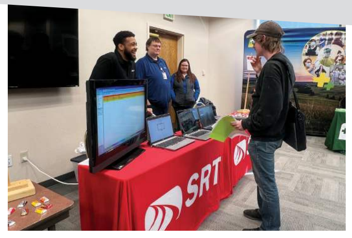
MSU CAREER EXPO – Students got to learn about career paths at SRT and see real-time alarm and internet traffic monitoring.