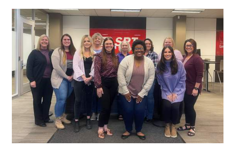
PURPLE UP DAY – Employees wore purple to show their support for military children at Minot Air Force Base and all over the world.