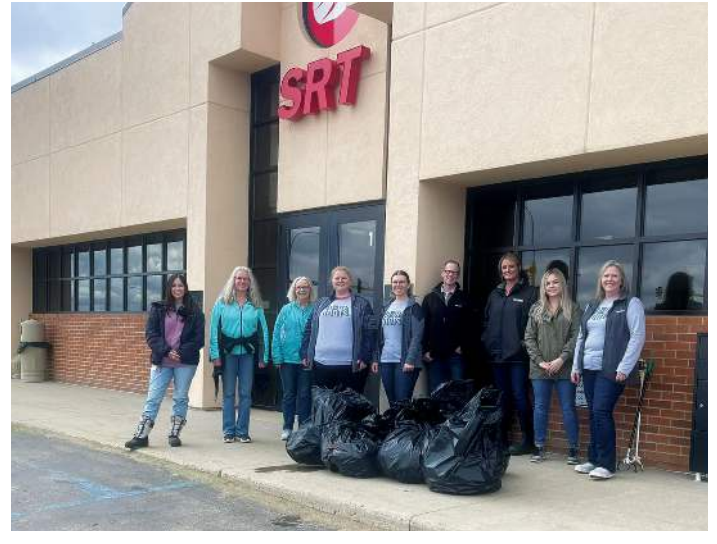
CITYWIDE CLEANUP – Organized by the Minot Area Chamber EDC, SRT employees took part in the annual citywide cleanup by picking up litter around and near SRT headquarters.