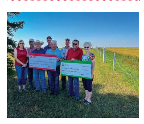
EMMANUEL LUTHERAN CEMETERY CHECK PRESENTATION — SRT Board members and cemetery volunteers held a check presentation for a grant match from SRT and the Rural Development Finance Corporation. Cemetery volunteers used the funding to replace old fencing.