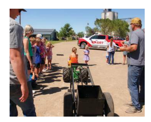
RENVILLE COUNTY FAIR – SRT proudly sponsored the annual kids' Coin Hunt and Tractor Pull at the Renville County Fair.