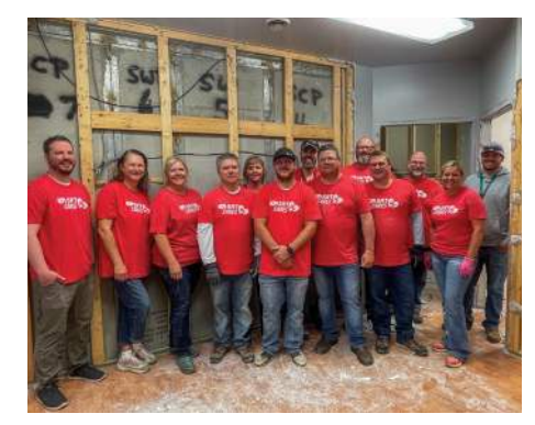
SVUW DAY OF CARING — Employees rolled up their sleeves to demolish the old Knowles Jewelry building. The work contributed to an area-wide Day of Caring through the Souris Valley United Way.