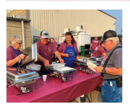
KX CO-OP DAY — SRT Board members volunteered to serve a pancake breakfast in the morning and ice cream sandwiches in the afternoon at the North Dakota State Fair.