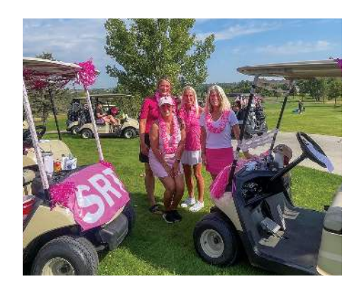
TRINITY WOMEN'S BUILDING HOPE GOLF TOURNAMENT — SRT employees swung for hope at the annual Trinity Health Foundation fundraiser.