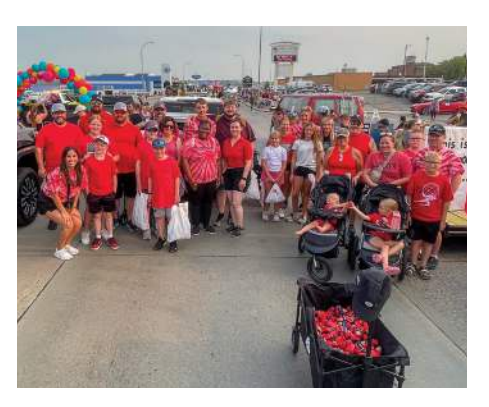
ND STATE PARADE — SRT was one of more than 180 floats in the ND State Parade. Nearly 30 people walked on behalf of SRT.