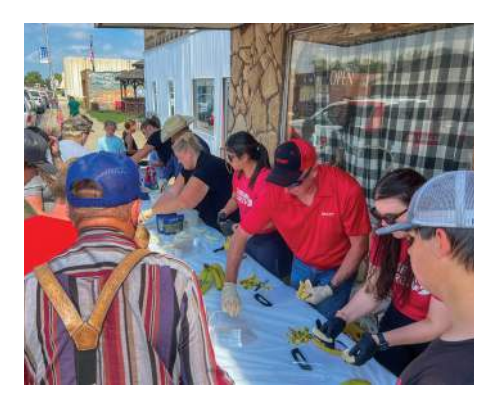
TOWNER CRAZY DAYS – Smiles and banana splits were once again served at Towner Crazy Days, one of SRT's favorite traditions!