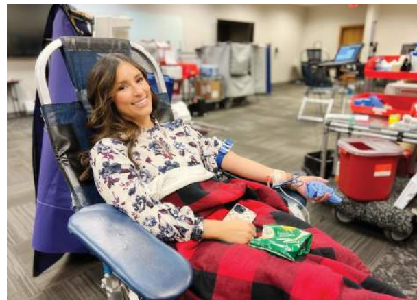
EMPLOYEE BLOOD DRIVE - Employees are invited three times a year to donate blood at Vitalant blood drives held at SRT headquarters.