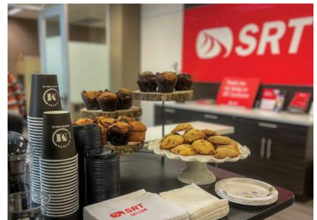
CO-OP MONTH - National Co-op Month was celebrated in October. SRT offered treats and coffee to walk-in customers every Wednesday, featuring local businesses throughout the service area.