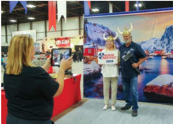
NORSK HØSTFEST - SRT, a proud sponsor of the Norsk Høstfest, took photos of festival goers in front of a Scandinavian backdrop. The 2024 scene at the SRT booth was set in Norway's Lofoten Islands.