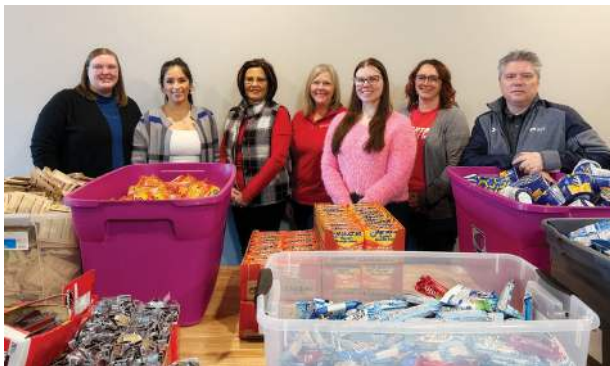
BACKPACK BUDDIES - In December, employees volunteered to pack more than 400 meals at Souris Valley United Way to help with the Backpack Buddies program. The program provides food for school children who might not otherwise have food over the weekend.